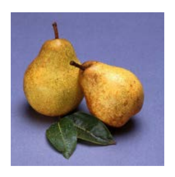
Pear "Blake's Pride"